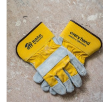
Volunteer Needs & News