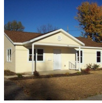
Delphos Build Developments